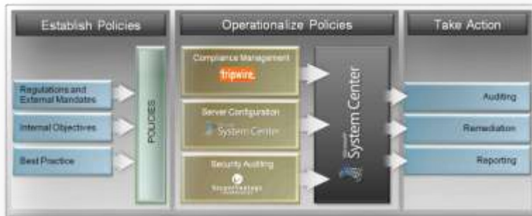
Figure 2: System Center supports server compliance

Finally, the cost of scaling compliance and security-based activities to the datacenter while managing the impact of human error remains challenging. As shown in Figure 2 below, System Center reduces these costs by providing solutions that unify configuration drift monitoring with compliance status and security audit data from specialist vendors such as Tripwire and SecureVantage. By delivering this into the System Center operational management environment, this enables the IT staff directly responsible for change and configuration of servers in the datacenter to receive actionable data related to compliance and security status